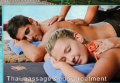
Thai massage & body treatment