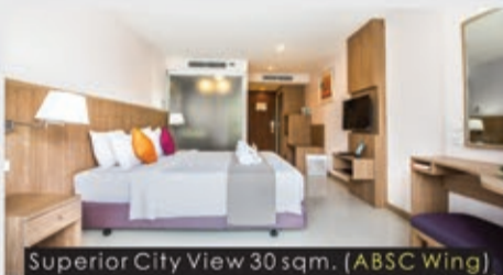
Superior City View 30 sqm. (ABSC Wing)

The Andaman Beach Suites Hotel, with 140 rooms, located in the heart of Patong Beach, is the ideal choice for discerning travelers. A variety of elegantly designed rooms caters for all types of vacations - a romantic getaway, families, groups, or just a place to relax and enjoy the tropical ambience of Phuket's renowned beach area. The hotel is set back a few hundred metres from the beach area so there is no traffic noise to disturb a peaceful night's sleep. Guest rooms are provided in two buildings. A small low rise 5 storey building is a few metres from the main entrance and reception area. This is the ideal choice for those on a budget, but still with full access to all the main hotel facilities and it also has its own rooftop swimming pool. The main building is comprised of 21 floors with all rooms providing panoramic sea views over Patong Beach. Room sizes, among the largest in Patong, range from a minimum of 40 sq metres up to 120 sq metres for two bedroom family suites.