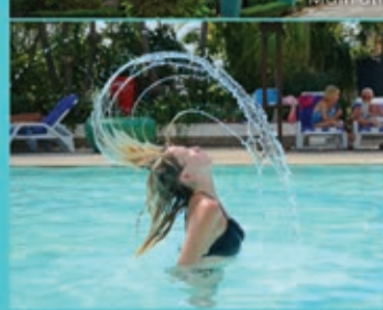
Main swimming pool