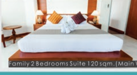
Family 2 Bedrooms Suite 120 sqm. (Main Wing)