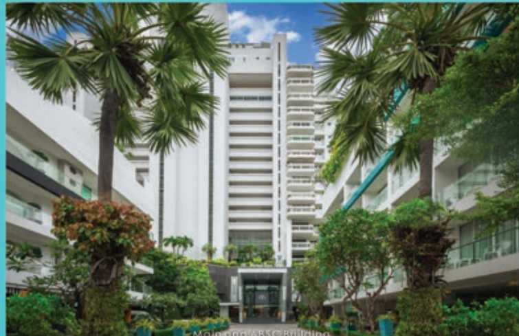
Main and ABC Building