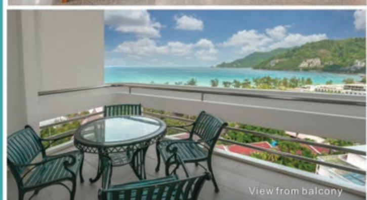
View from balcony